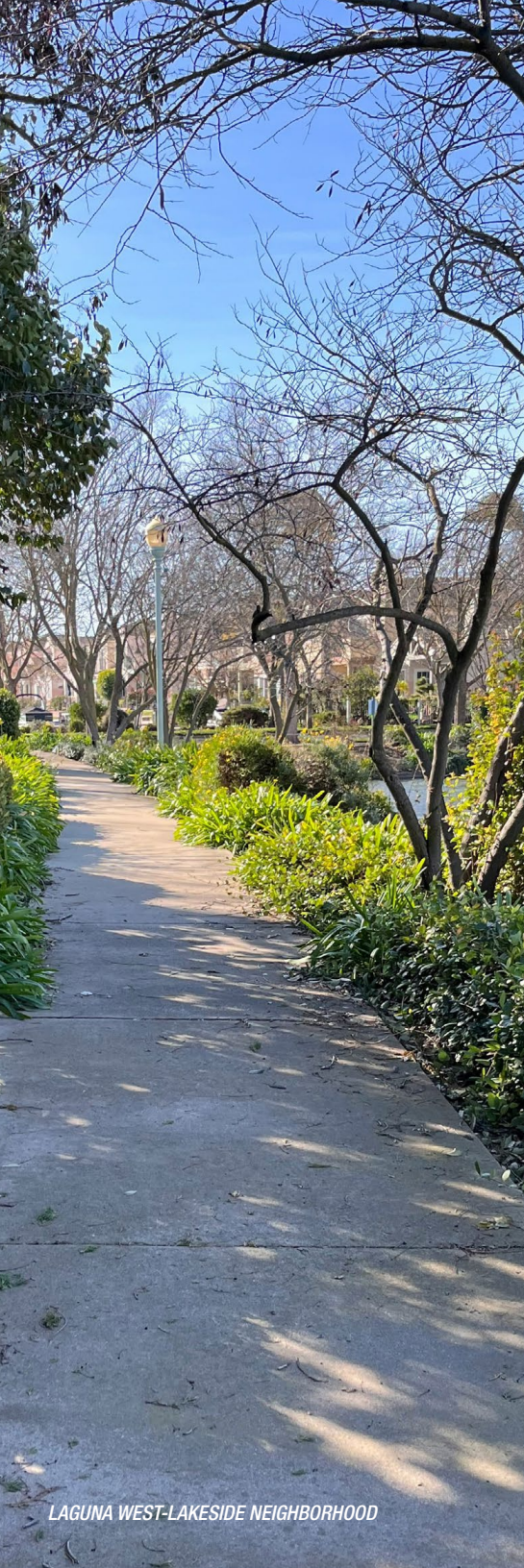
LAGUNA WEST-LAKESIDE NEIGHBORHOOD