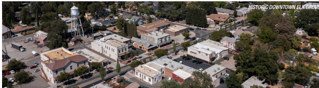
HISTORIC DOWNTOWN ELK GROVE