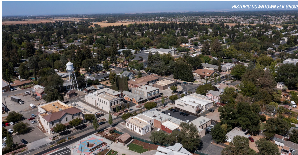
HISTORIC DOWNTOWN ELK GROVE