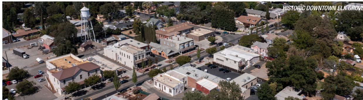
HISTORIC DOWNTOWN ELK GROVE