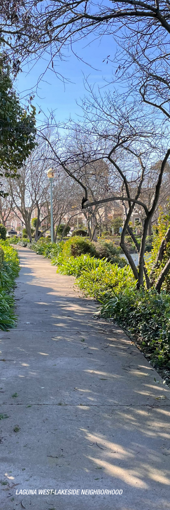
LAGUNA WEST-LAKESIDE NEIGHBORHOOD