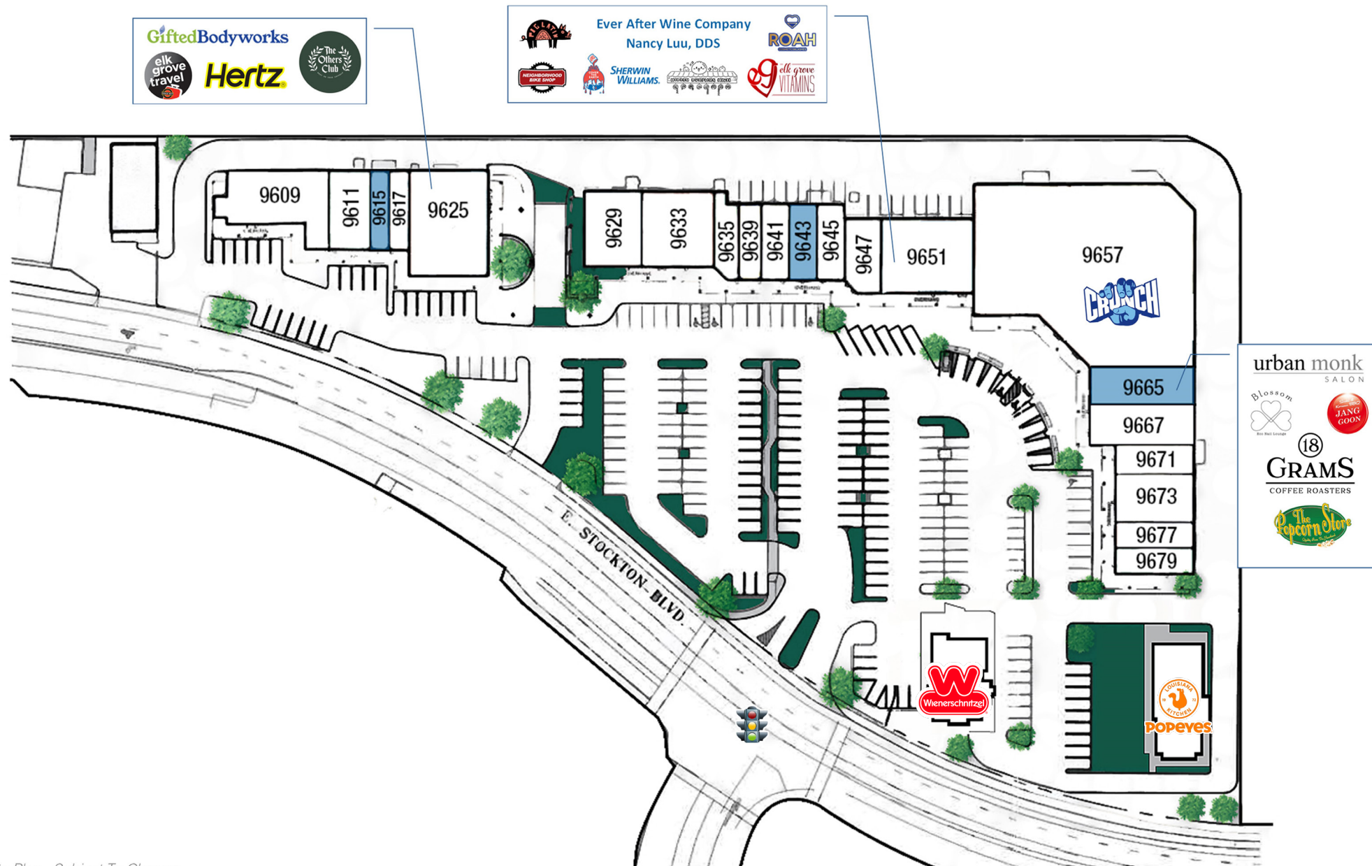
Site Plan - Subject To Change

9605-9675 E. STOCKTON BLVD. IN ELK GROVE, CA