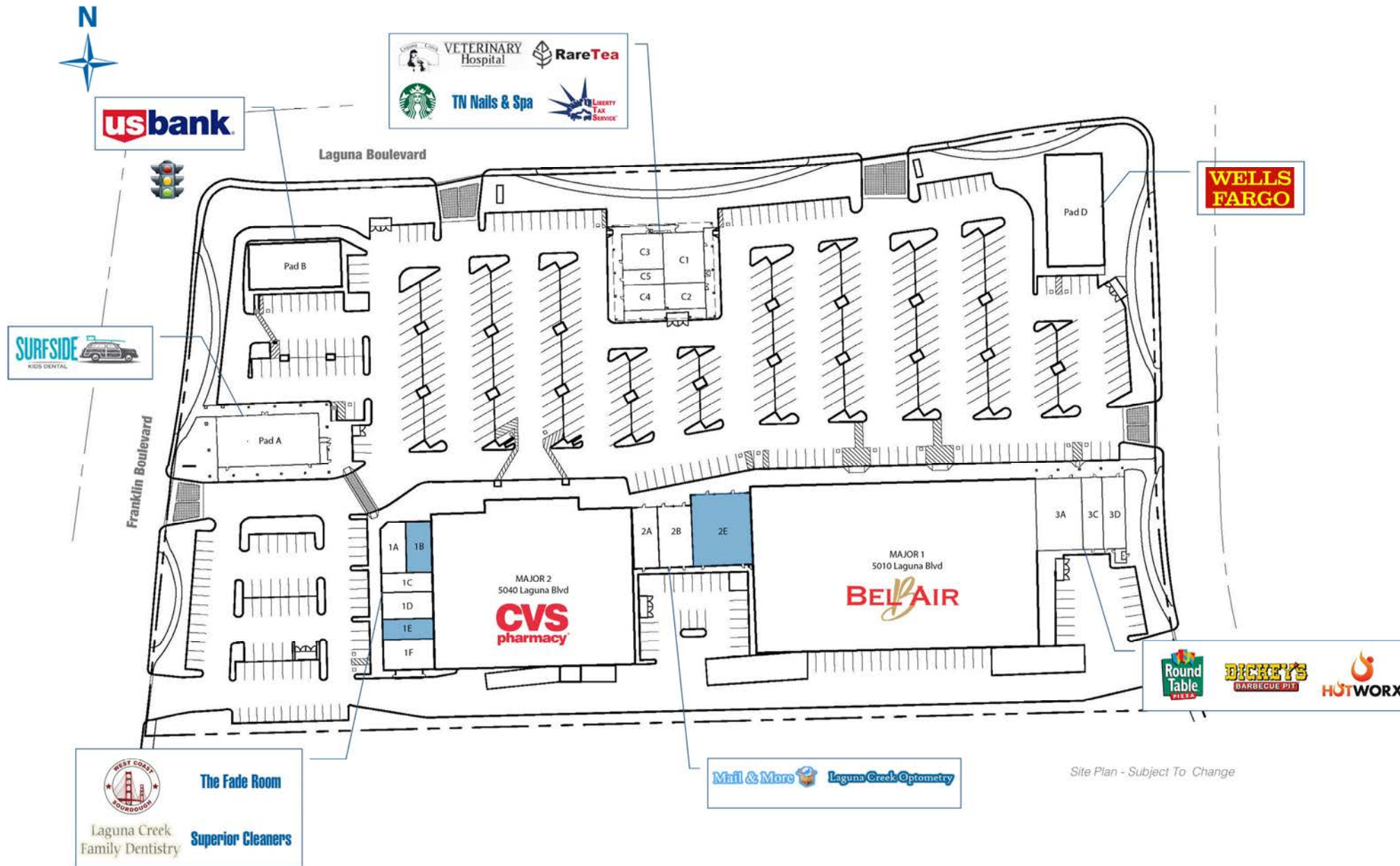
Site Plan - Subject To Change