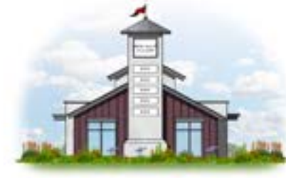
WESTGATE VILLAGE - PAD A SOUTH ELEVATION