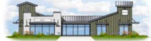
WESTGATE HILLside - PRO & WEST CENTRI ELEVATION