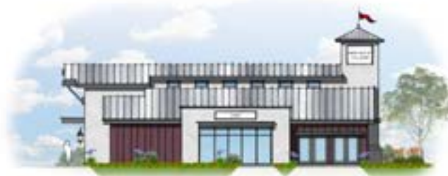
WESTGATE VILLAGE - PAD A WEST ELEVATION