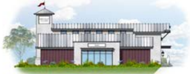
WESTGATE VILLAGE - PAD A EAST ELEVATION