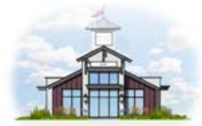
WESTGATE VILLAGE - PAD A NORTH (ENTRY) ELEVATION