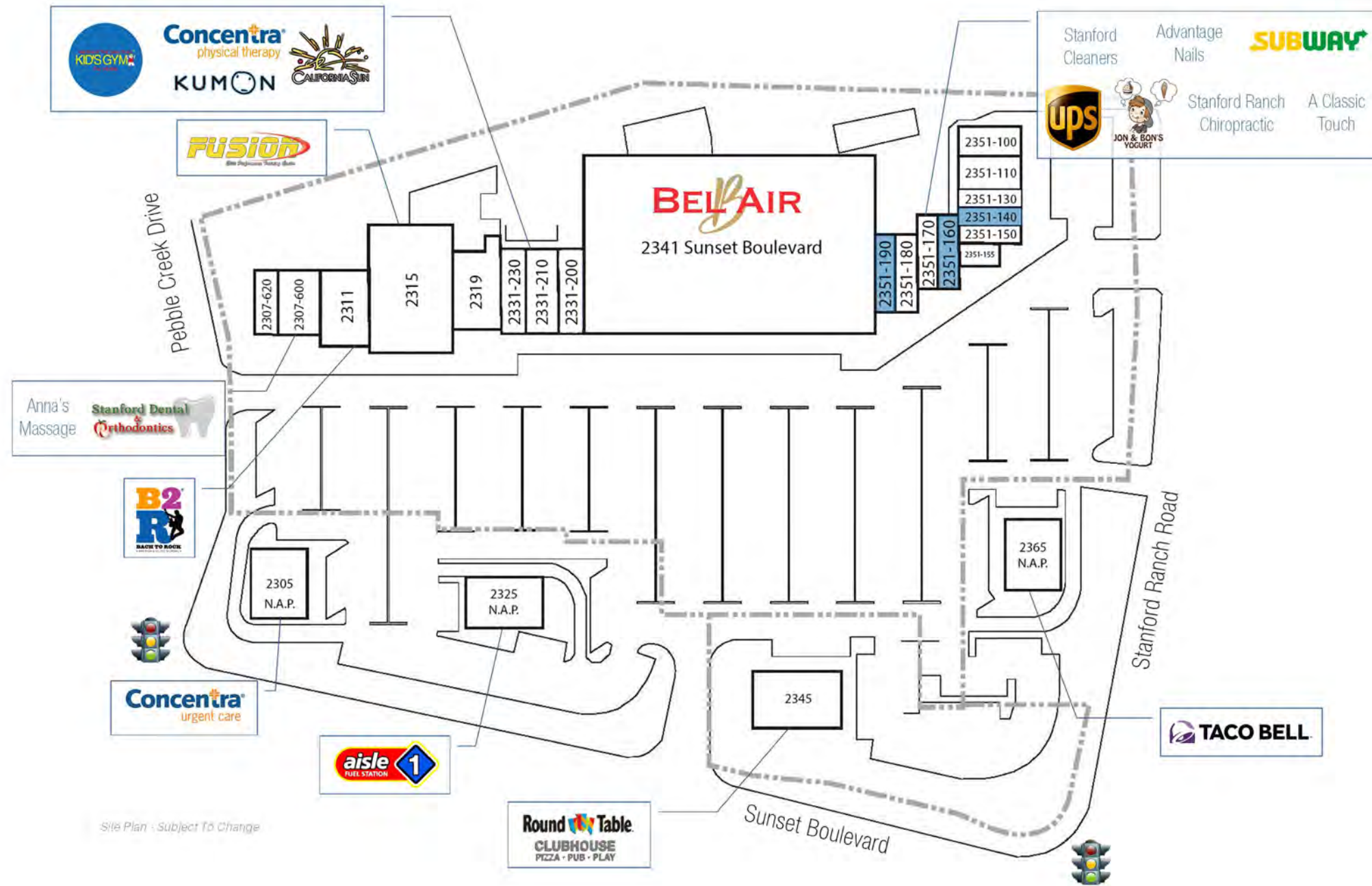
Site Plan - Subject To Change