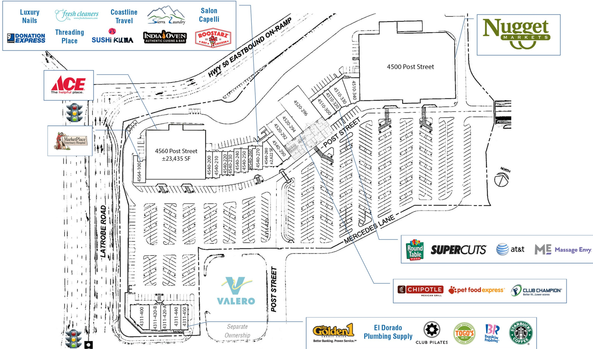
Site Plan - Subject To Change