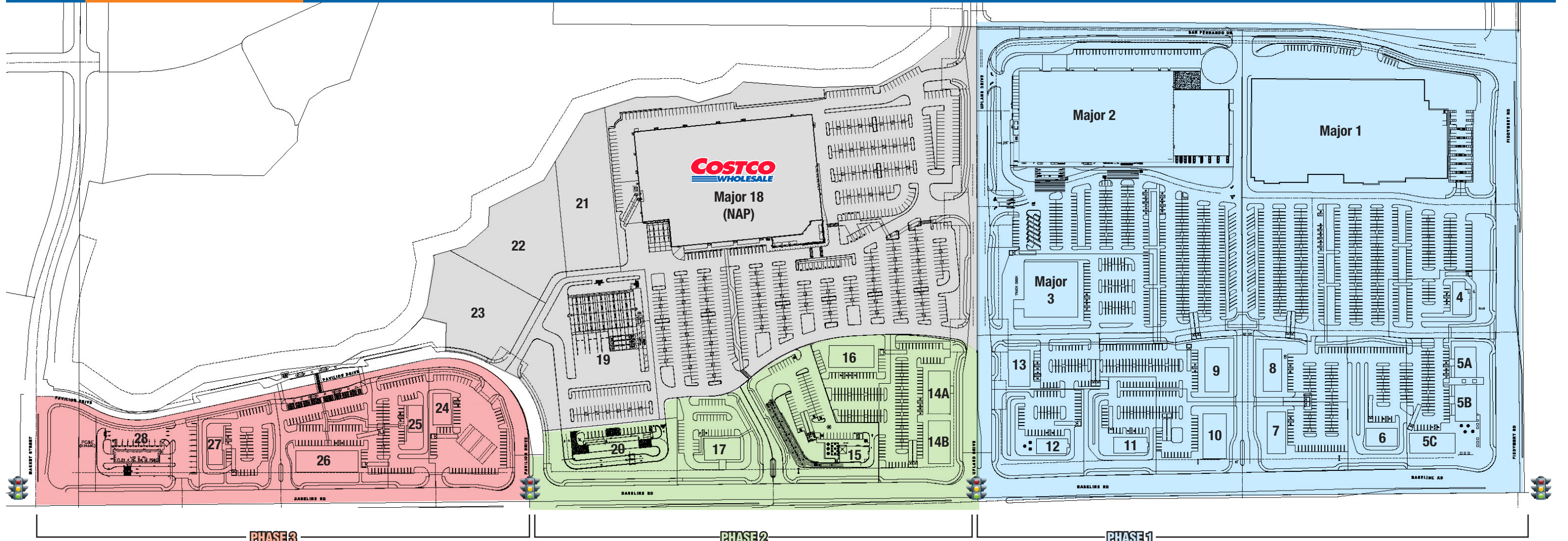
PHASE 3 ± 7.03 Acres • ± 20,080 SF