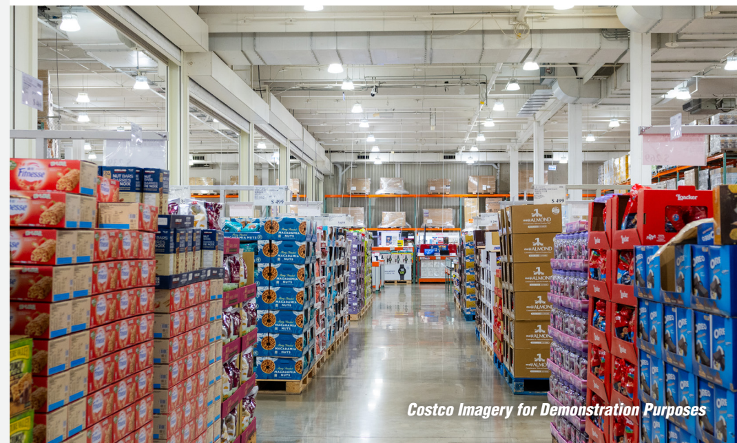
Costco Imagery for Demonstration Purposes