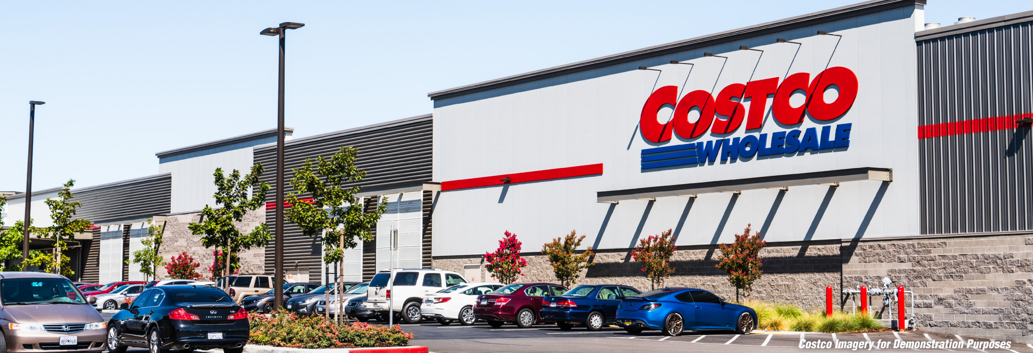
Costco Imagery for Demonstration Purposes